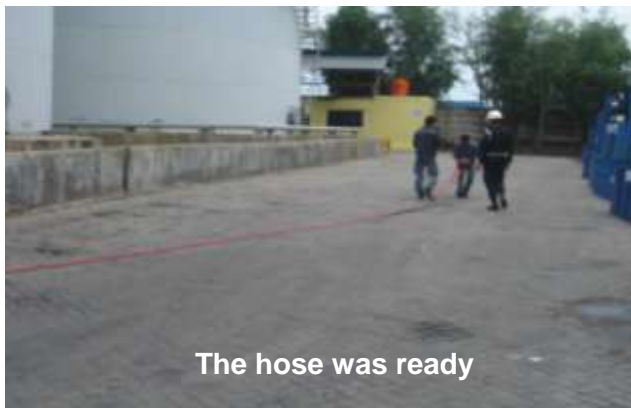
The hose was ready