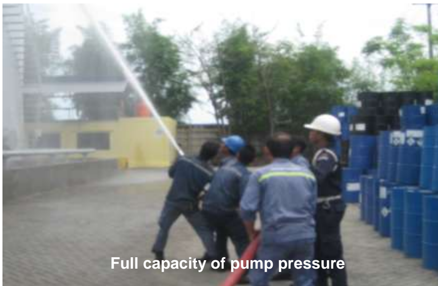
Full capacity of pump pressure