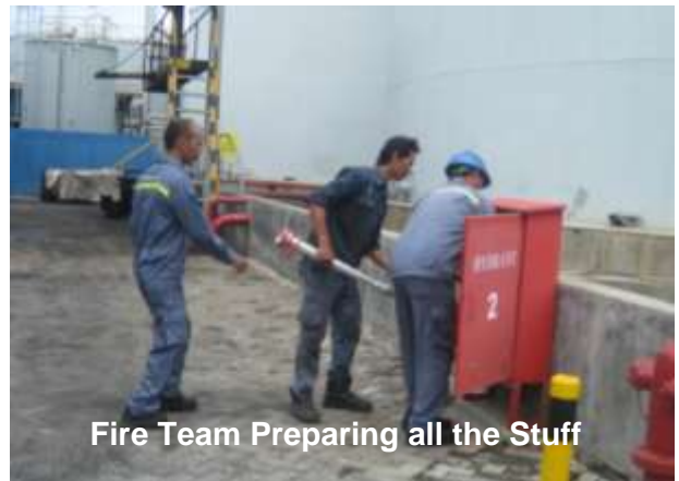
Fire Team Preparing all the Stuff