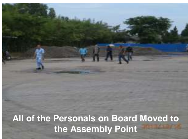
All of the Personals on Board Moved to the Assembly Point 2013/12/16