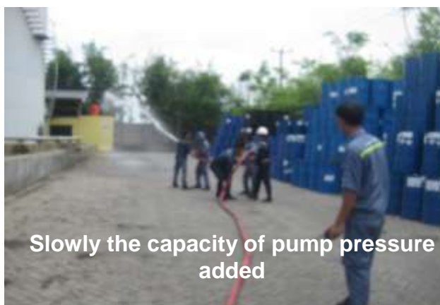
Slowly the capacity of pump pressure added