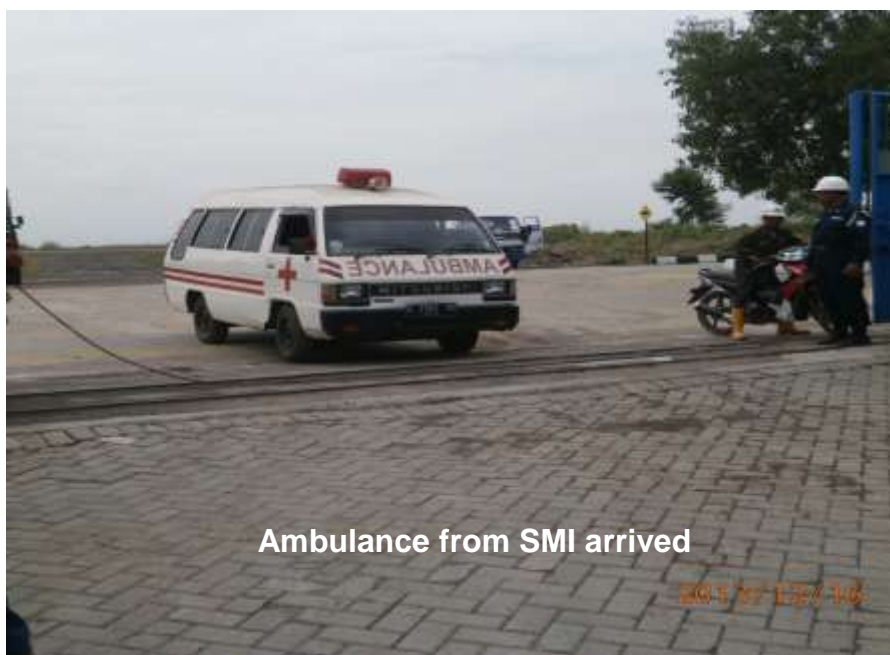
Ambulance from SMI arrived