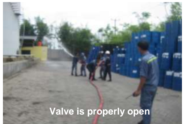
Valve is properly open