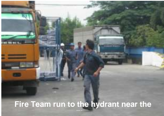
Fire Team run to the hydrant near the