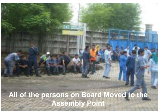
All of the persons on Board Moved to the Assembly Point