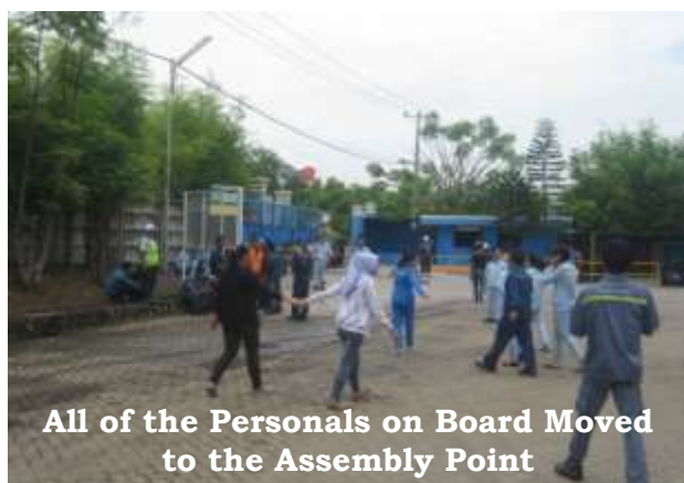
All of the Personals on Board Moved to the Assembly Point