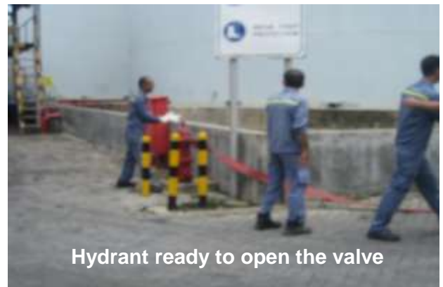
Hydrant ready to open the valve