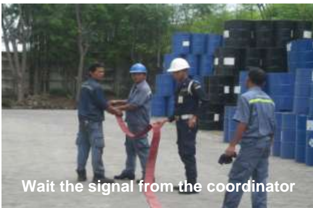
Wait the signal from the coordinator