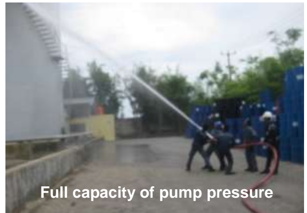
Full capacity of pump pressure