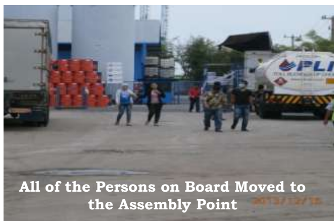
All of the Persons on Board Moved to the Assembly Point 2013/12/16