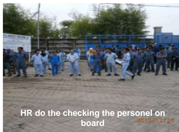
HR do the checking the personel on board 2013/12/16

Jumlah orang yang ada pada Tanggal 16 Desember 2013 s/d pkl. 11.15 WIB ( The quantity of personel on board on Dec 16 2013 until 11.15 AM)