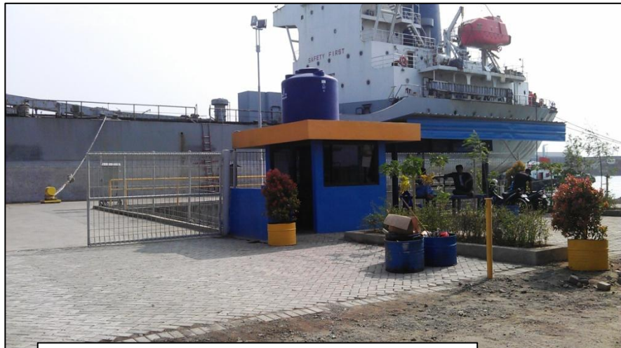
Vessel PAUS1 LOA 150m – docked at Jetty 1

Jetty 4 structure Completed. Dredging to start in Nov. Capacity available in Jan '12 to ease congestion at Jetty 2